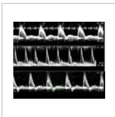
Spectral doppler.... 630 × 529; 66 KB