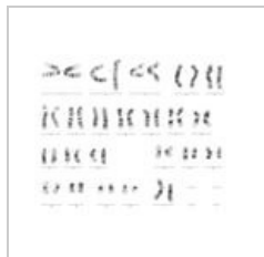
Deleční forma Tu... 1,232 × 964; 146 KB

The following 25 files are in this category, out of 25 total.