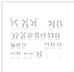
Karyotyp .jpg 1,232 × 964; 59 KB