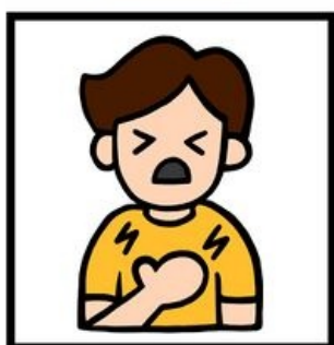
Bolest na hrudi